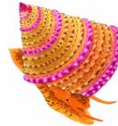
JEWELLED TOP SNAIL

How are these snails different from other snails in the same exhibit?