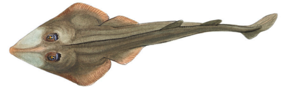
SHOVELNOSE GUITAR FISH

In what exhibit do you find these shark relatives?