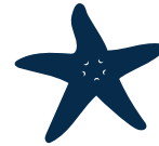
Ochre star Pisaster ochraceus